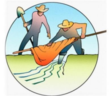
Sangre de Cristo Acequia Association