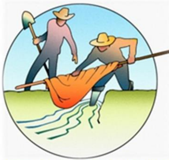
Sangre de Cristo Acequia Association