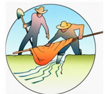
Sangre de Cristo Acequia Association